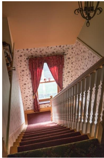
Through the Looking Glass © Brenda Fairfax