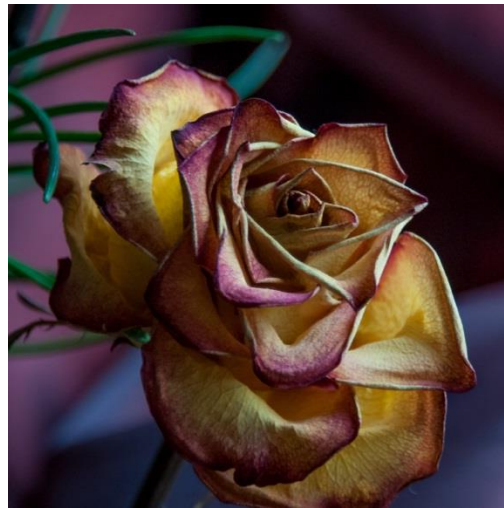
Marsala Edged Rose