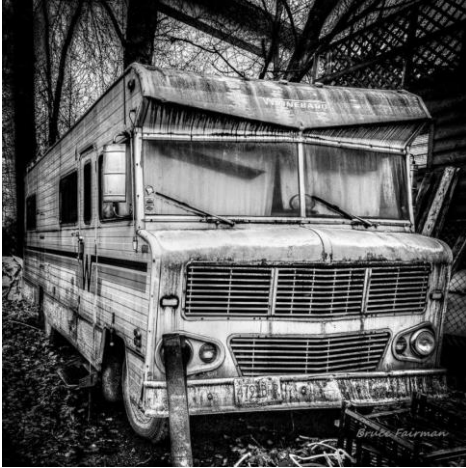
I'm on the road again

Two images from the recently closed “Vintage” theme. Remember to always vote for the images you think are strong and best depict the theme, even if you don’t think you have the experience or confidence to comment (yet). And be sure to take the time to view all the images and comments after each theme completes – a fantastic learning experience.