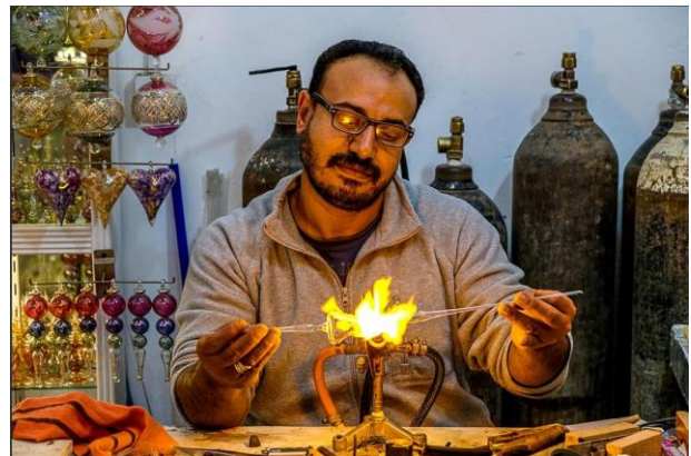
Glass Blowing