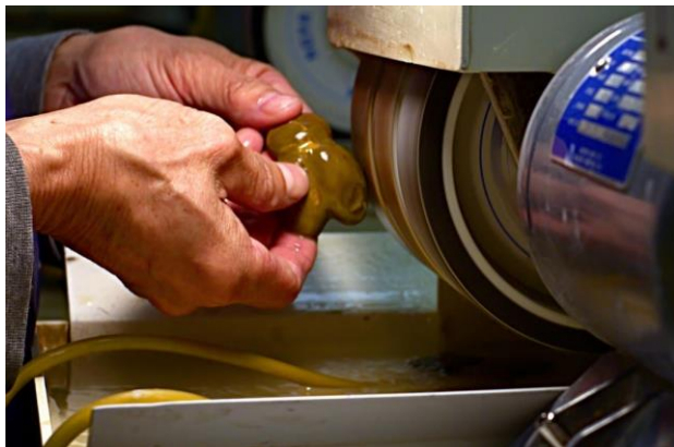
Shaping Stones