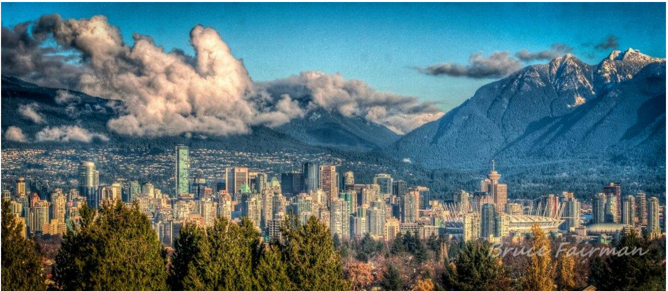
An outside shot