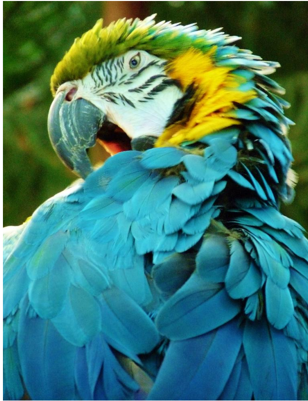
The wildlife inside by Karen Justice.